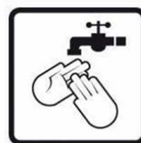
Rinse in cold water before washing