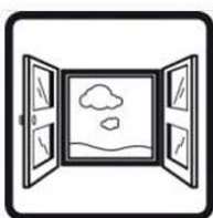
Ventilate working area if possible

“The mechanical effect of fibres in contact with skin may cause temporary itching”