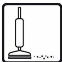
Clean area using vacuum equipment