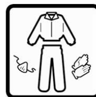
Cover exposed skin. When working in unventilated area wear disposable face mask