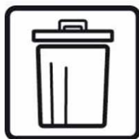
Waste should be disposed of according to local regulations