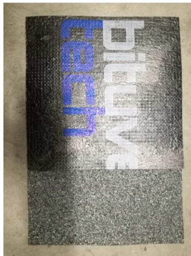
Photograph of a specimen

5 specimens, dimensions 250 mm × 250 mm and thickness equal to that of origin, were cut by the customer from the item.