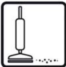
Clean area using vacuum equipment