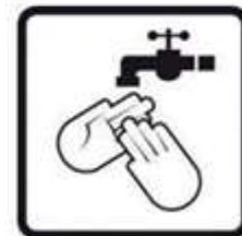
Rinse in cold water before washing